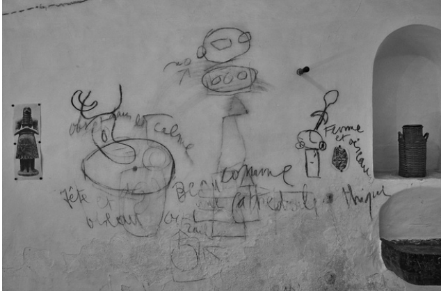
Son Boter upper floor room, 2014