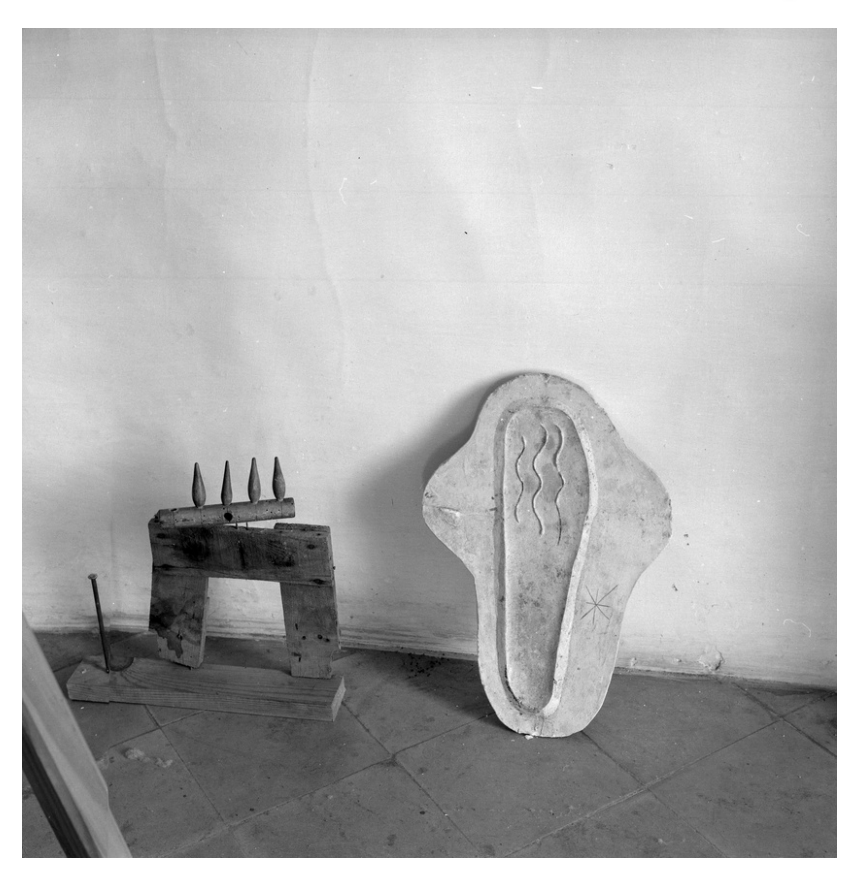
Model for the sculpture Jeune fille and plaster cast for the sculpture Femme dans la nuit at Son Boter, 1961