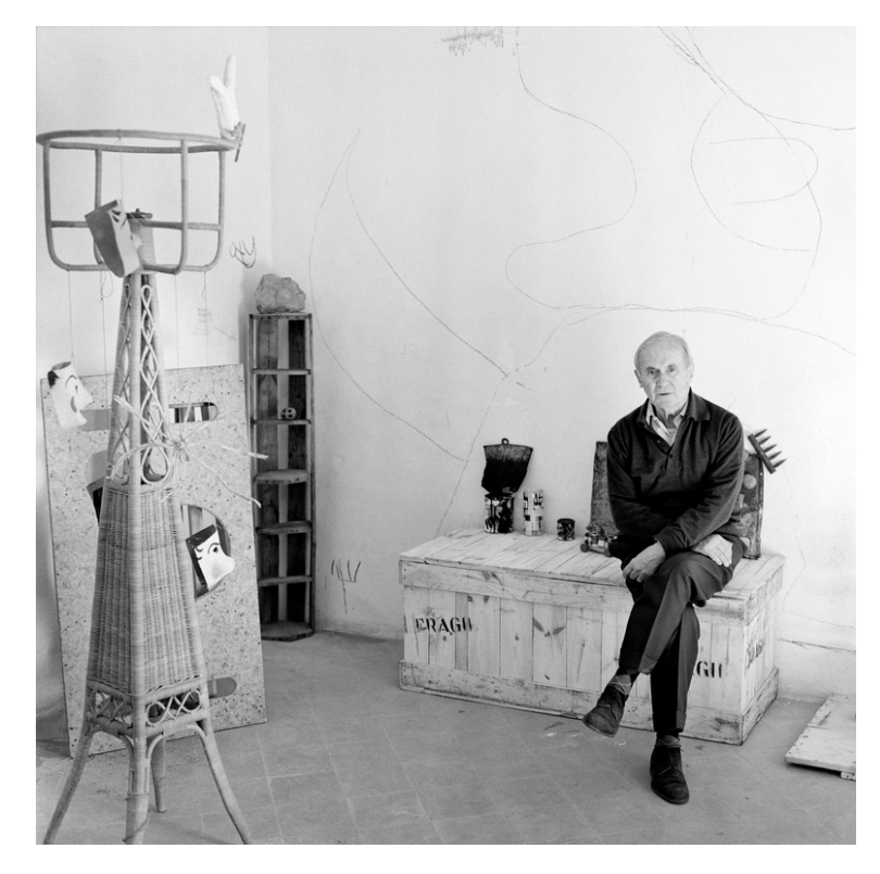
Joan Miró at Son Boter with the preparatory objects for the sculpture Souvenir de la Tour Eiffel, 1966