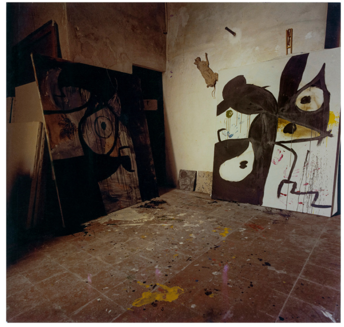
Femme, oiseau in progress at Son Boter, 1973